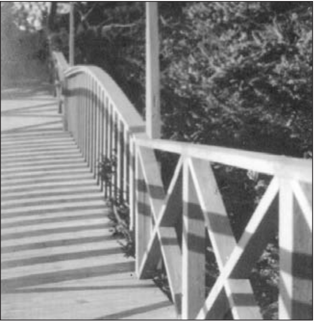
Wooden footbridge marking trail to the beach.