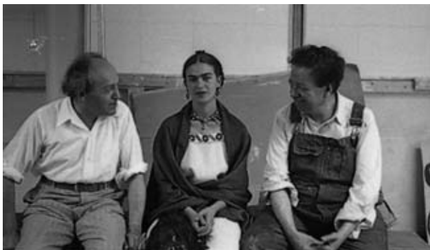
Ernest Bloch with Frida Kahlo and Diego Rivera.