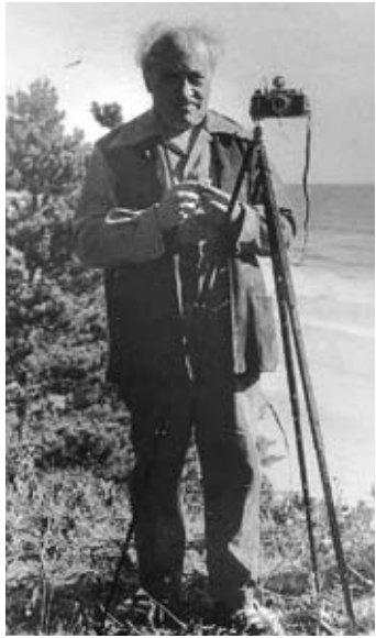
Ernest Bloch, the photographer