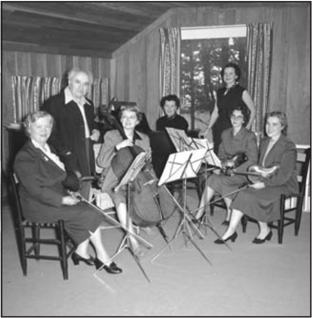
Bloch with string class from Eugene in 1953. This shows the southeast corner of the second floor Studio (a separate building from the main house), with stairs coming up on right and piano to the left. He could see the Pacific Ocean from the window in the background. Bloch would have spent many hours here, alone and with musicians who would come for his counsel.

philanthropy and for being good people, one of the most highly regarded families in this State, have done things in a grand manner. The house has a huge stone cellar (with sink for washing clothes and an oil tank), but all the rest, one floor, is in cedar. I embrace you all with all my heart.” 30 The stone cellar housed his collection of wines at the perfect temperature.