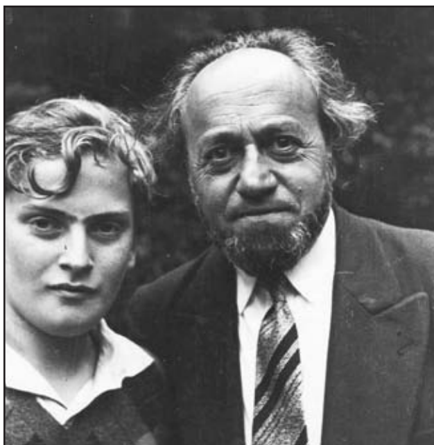
Yehudi Menuhin and Ernest Bloch in 1928

Menuhin characterized Ernest Bloch, whom he met as a child growing up in San Francisco, as 'the musician as Old Testament prophet, whose speech was thunder and whose glance lightning, whose very presence proclaimed divine fire by which, on occasion, a bystander might feel himself scorched.'