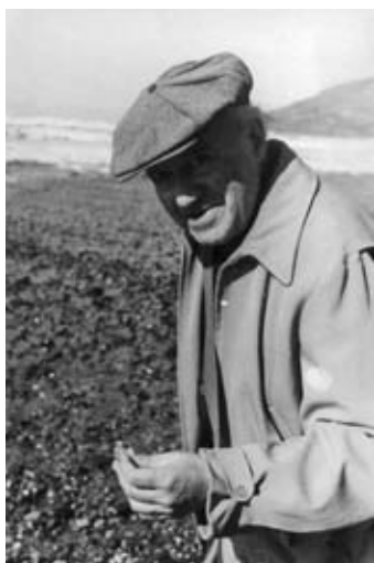
Ernest Bloch on the beach collecting agates.