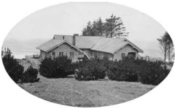
Bush House as Ernest Bloch might have first seen it in 1941.