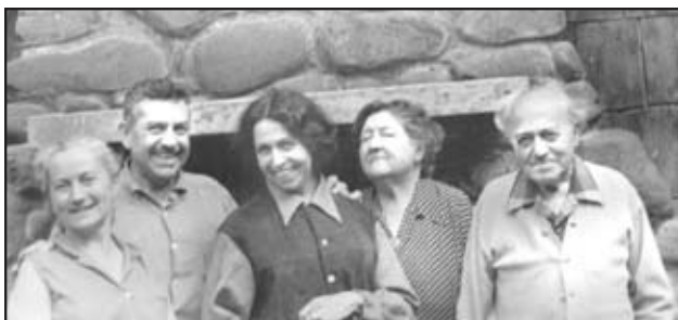
The Bloch Clan in 1959