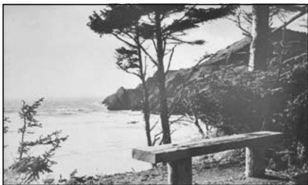
"He and I used to sit on that bench and rest after the climb up from the beach." — Ernest Bloch II — Agate Beach early 1950s — (Photograph by Lucienne Bloch, courtesy Old Stage Studios.)

Bloch's late solo violin suites were commissioned by Yehudi Menuhin. Menuhin