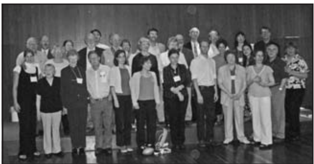
The Ernest Bloch Conference, at Cambridge University’s Fitzwilliam College, sponsored by the Jewish Music Institute in July 2007 drew participants from many different countries. The conference was subtitled “2009 and Beyond.”

Since 2007 other groups have formed societies in the United Kingdom (International Ernest