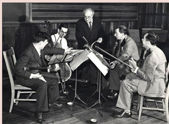
Ernest Bloch with The Griller Quartet in 1947