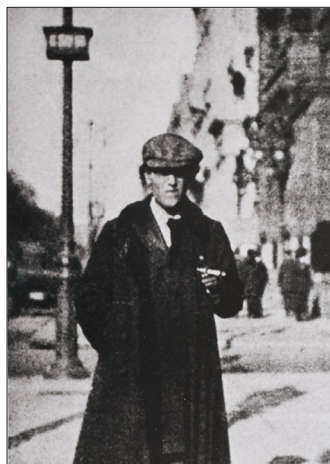
Gustav Mahler, musical director of the New York Philharmonic, on the streets of Manhattan in 1910.

Mahler's early death meant that any contact between these two great Jewish composers was limited. However, on 15 June 1903 Bloch heard Mahler conduct his second symphony.