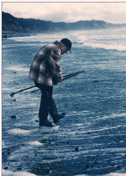
Above: Ernest Bloch on Agate Beach, California.